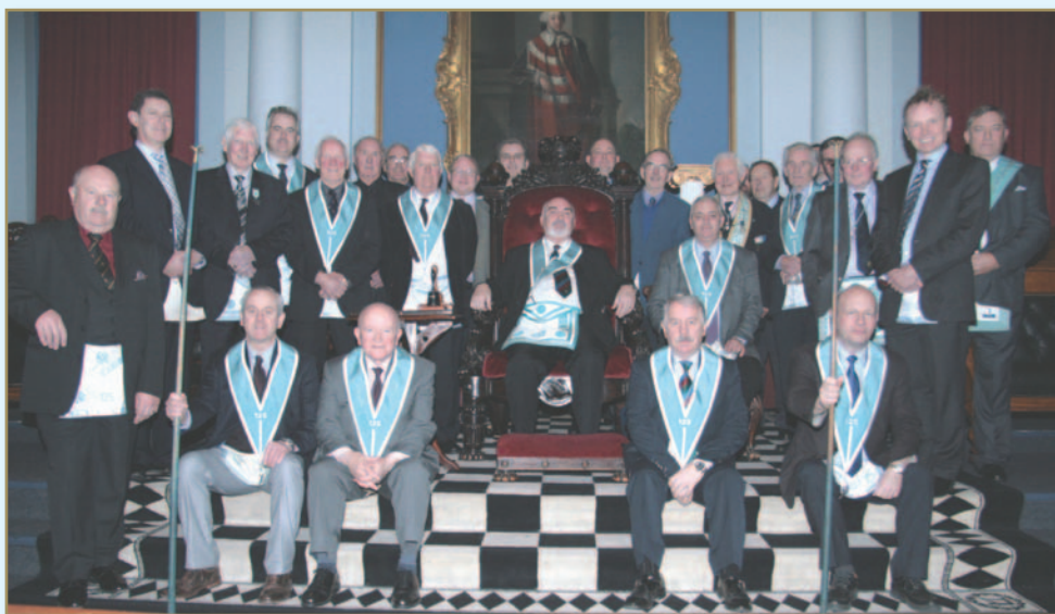
Officers and Members of The Lodge of Fidelity No. 125 photographed at a recent meeting in the Grand Lodge Room.

This year the Lodge of Fidelity No. 125 proudly celebrates its 175th Anniversary. The Warrant for the Lodge was issued on the 20th November 1837, a year that heralded a momentous period in World affairs, being the Coronation year of Queen Victoria. These were exciting times for the formation of a new Lodge, the founding Brethren embraced the enthusiasm of the Victorian age and their Masonic activities with a vigour and so laid the solid foundation upon which this Lodge still flourishes today.