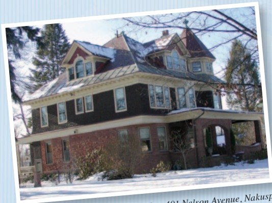
Queen Anne Turret Bed & Breakfast 401 Nelson Avenue, Nakusp.

2012 - Ireland! We have a school teacher, in our Village, who's currently doing a professional exchange with his counterpart in Australia.